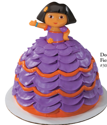
Dora the Explorer™ Fiesta Dress DecoSet® #30063 - 6/Pkg.