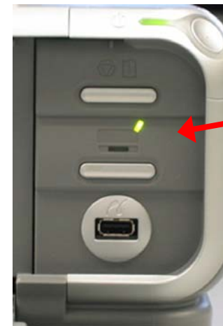
The PhotoCake® ¼ Sheet Printer

Front receiving tray – Finished toppings and forms come out here