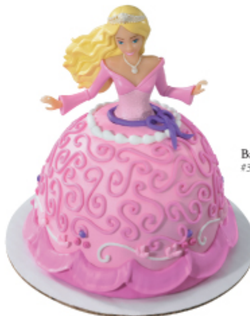
Barbie™ Perennial DecoSet® #30099 - 6/Pkg.