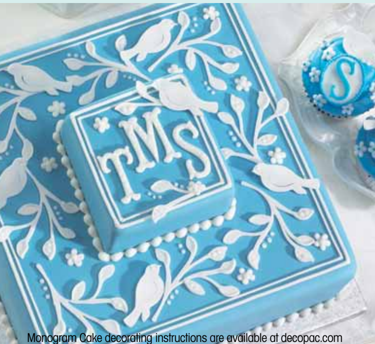
Monogram Cake decorating instructions are available at decopac.com

What You'll Love About Fondant DecoSheets™