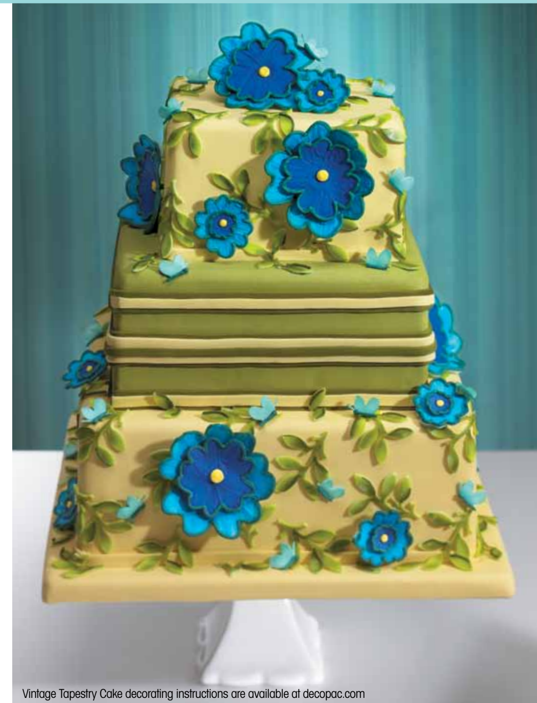
Vintage Tapestry Cake decorating instructions are available at decopac.com